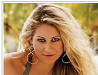
She's Recently Single After 12 Years. To Celebrate, Here are 28 Stunning Photos of Anna Kournikova