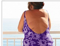
How Seniors Can Scoop Up Free $20,500 Checks (See If You Qualify)