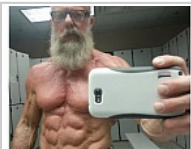
[ Massachusetts ] man finds an unlikely testosterone booster.