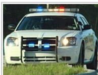
Westport - New rule allows many Massachusetts residents to get car insurance at half-price.