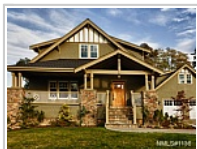
Massachusetts: Here's a little known way to pay down your mortgage.....